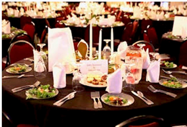
Elegant tables were crafted by the staff members of Carolina Pregnancy Center in Spartanburg, SC.