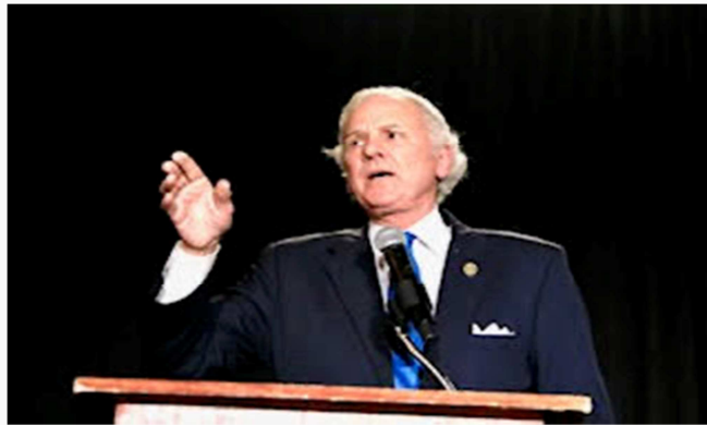
Governor Henry McMaster delivers words of support for South Carolina Citizens for Life.