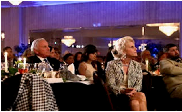
South Carolina Governor and First Lady, Henry and Peggy McMaster, focus on the Viable performance.